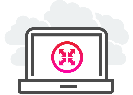
MCR Cloud to Cloud Connectivity...